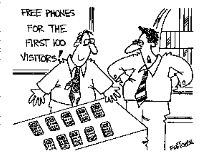
NO...I SAID, IN ORDER FOR OUR CHURCH TO GROW IN THIS CILLTURE, WE NEEDED AN ELECTRONIC PRESENCE.

Members can attend community events as a group wearing hats or t-shirts bearing the church logo. If parade, walk, or run routes pass by the church, consider organizing volunteers to hand participants cups of water or other refreshments. Many churches